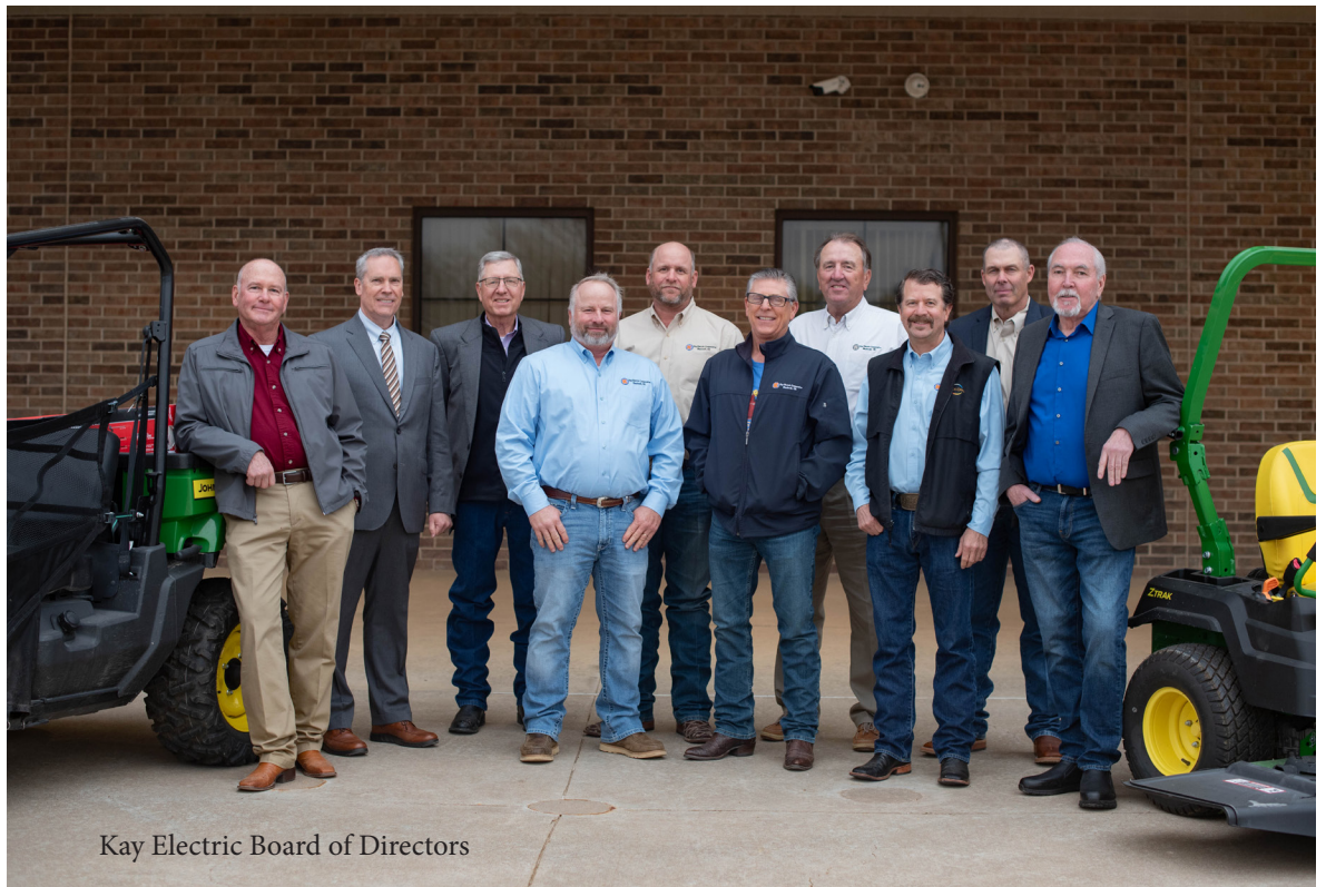
Kay Electric Board of Directors