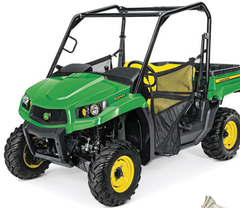
John Deere Gator