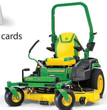
John Deere Zero Turn Mower

Drive thru for your chance to win one of these prizes!