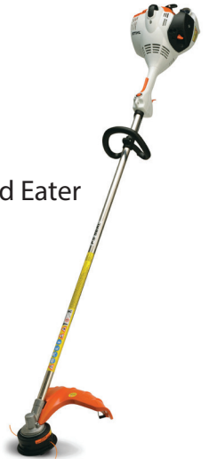
Stihl Weed Eater