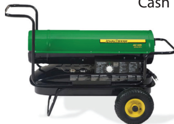
John Deere Shop Heater