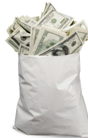
Cash prizes & gift cards